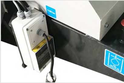
Thermal-magnetic switch panel and power line inlet.