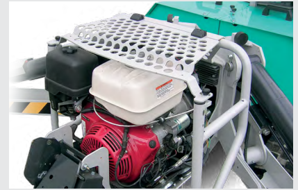
Rugged engine guard for improved protection.