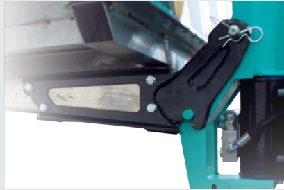
Easily attach or remove the basket with the one-pin mounting system.